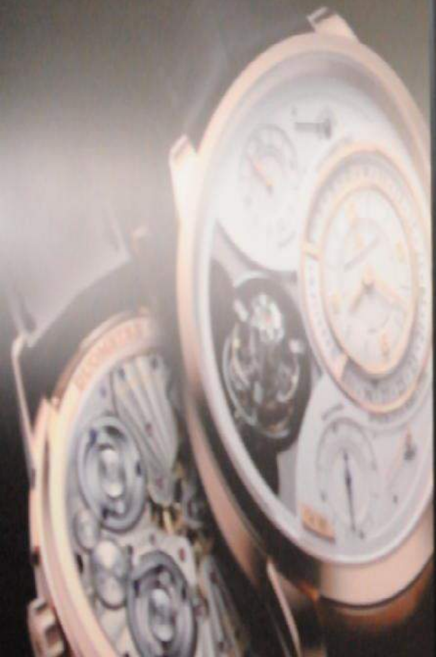
Duomètre Sphérotourbillon 双翼立体双轴陀飞轮腕表